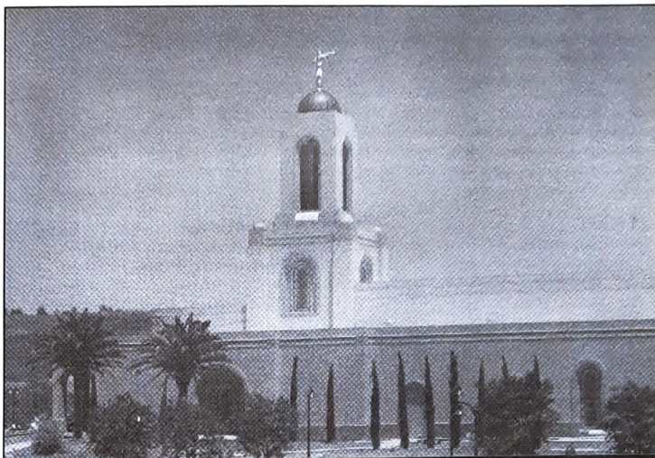
newport beach, california

• The priests officiating in the Jerusalem temple had to be from the tribe of Levi. This was commanded in Numbers 3:6-10. The Mormon Church ignores such commands and allows its "temple-worthy" members who have no such background to officiate in its temples.