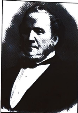
Brigham Young "The Christian world...are heathens as to the knowledge of the salvation of God."

If someone made a claim to represent Mormonism but instead denied or distorted the doctrines that make Mormonism what it is (i.e. denial of Joseph Smith, Book of Mormon , etc.), this person would be quickly challenged and denounced by Latter-day Saints everywhere. Therefore, when LDS leaders deny or distort doctrines held dear by Christians all over the world, does it not make sense that their claim to Christianity should be challenged by faithful Christians who hold dearly to biblical truth?